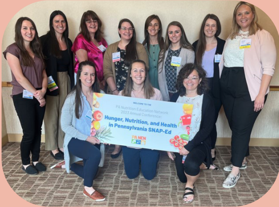
PA Nutrition Education Network 2023 Annual Conference