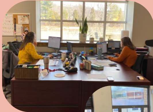
New Offices: Cambria & Turtle Creek